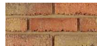
KNIGHTSBRIDGE OLD YELLOW