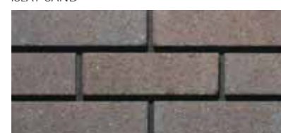
FARNE BRUISED MULTI